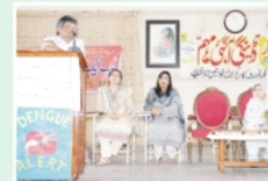
Govt. College for Women, Township Lahore