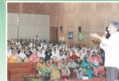
Govt. Fatima Jinnah College, Chuna Mandi, Lahore