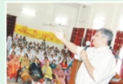
Govt. College for Women, Baghbanpura, Lahore