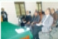
Ms. Aftab Begum, Minister for Forestry, Wildlife & Fisheries, addressing the meeting on Eucalyptus Extension (Language: Punjabi) at Government Building, G-11, Rawalpindi.