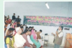
Govt. Govt. College University (GCU), Lahore