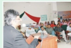
Govt. Girls College for Women, Marghzar Colony, Lahore