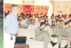
PAF Air Base, Lahore