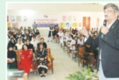
Govt. College for Women, Model Town, Lahore