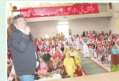
Govt. APWA College, Lahore