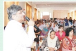
Govt. Degree College for Women, Wapda Town, Lahore