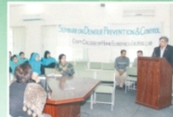
Govt. College of Home Economics, Gulberg, Lahore