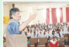
Govt. Ayesha Post Graduate College for Women, Lahore