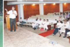
WAPDA House (Auditorium), Lahore