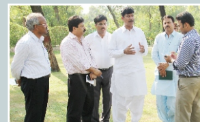
Minister for Forests, is giving interview to Electronic & Print Media