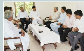
Minister for Forests, at Jallo Park with Chief Conservator of Forests