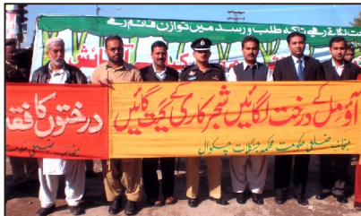
Shajarkari Walk in Chakwal organized by DOF Chakwal