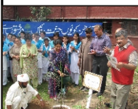
Mass Planting by Students, of Home Economics College, Lhr.